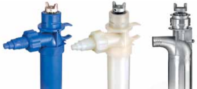
PF Series Drum Pump Tubes