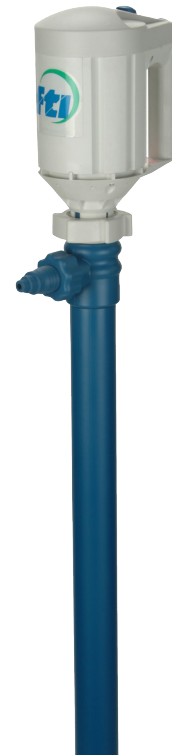
PFP with M3V motor