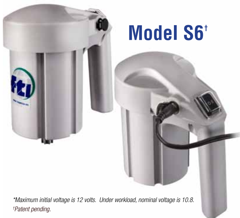
Model S6 +